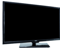
Swivel Base Design